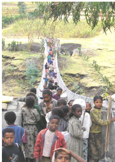
Hundreds of children in the vicinity of each new bridge now have access to schools and rural health clinics