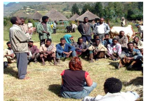
Participation by villagers in every stage of the bridge planning and building process