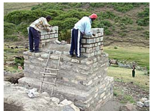
Local villagers applying their newly acquired masonry skills on a new bridge tower