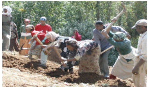
Mostly women digging the bridge foundations