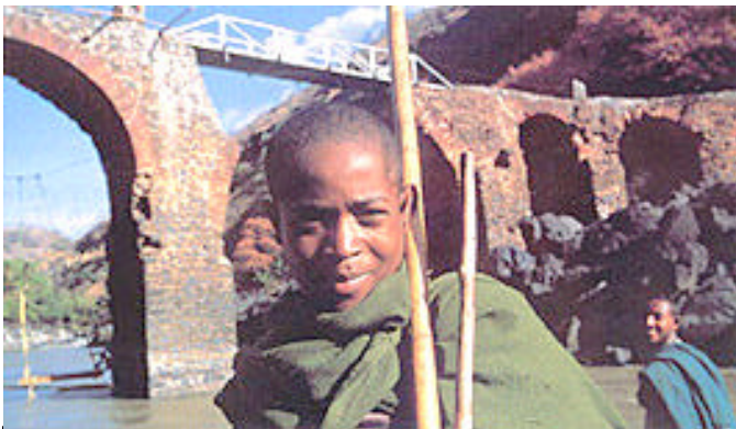
Sabara Dildiy Bridge, Blue Nile River, Ethiopia